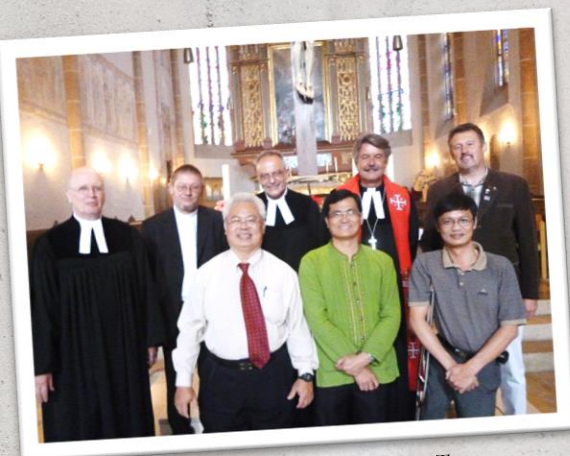
With pastoral staffs of the Gunzenhausen Town Church..

“I remember that I was around ten when I suddenly felt strongly that I wanted to be a pastor..”